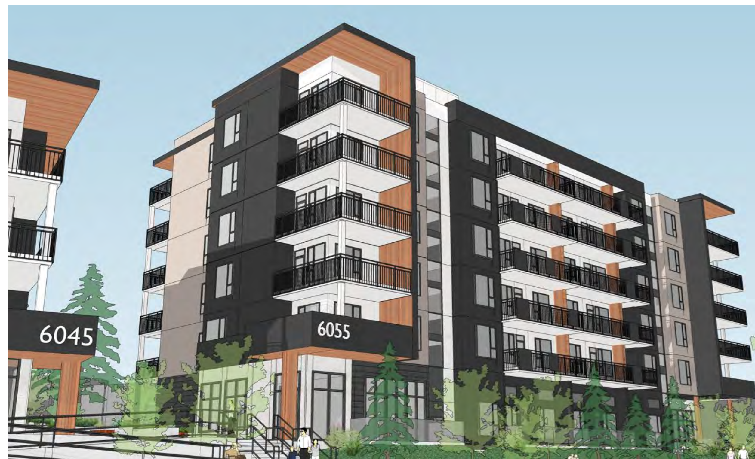
View Of Plaza And Entry From Linley Valley Drive