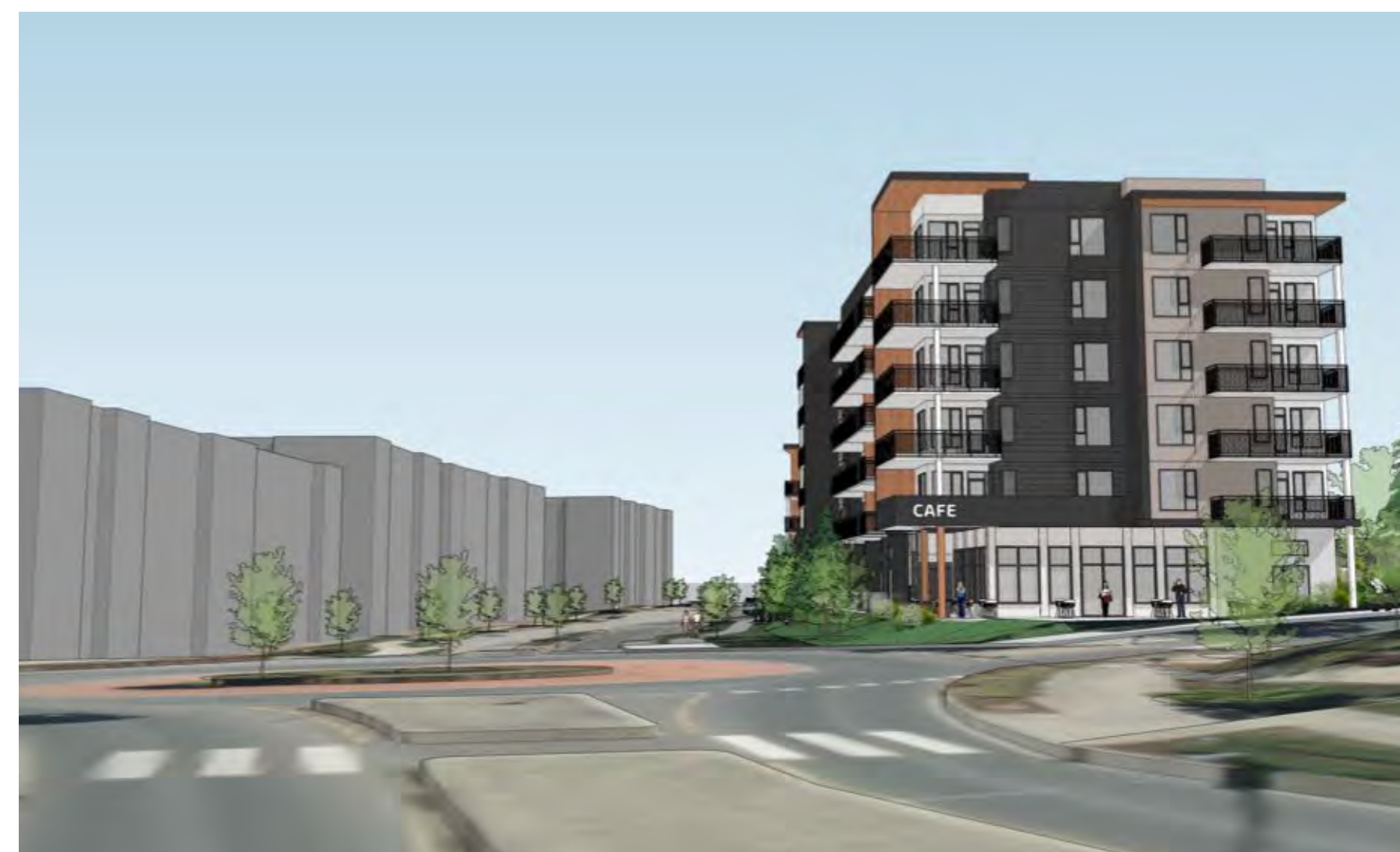
View From Turner Road to Linley Valley Drive