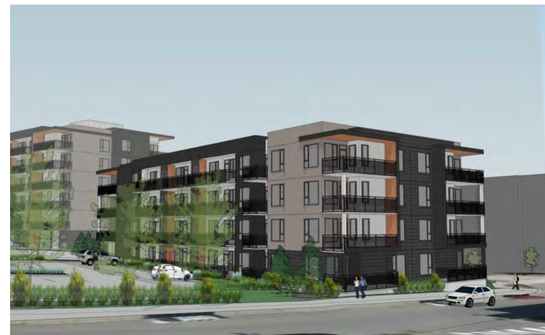
View From East Street Looking Toward Linley Valley Drive