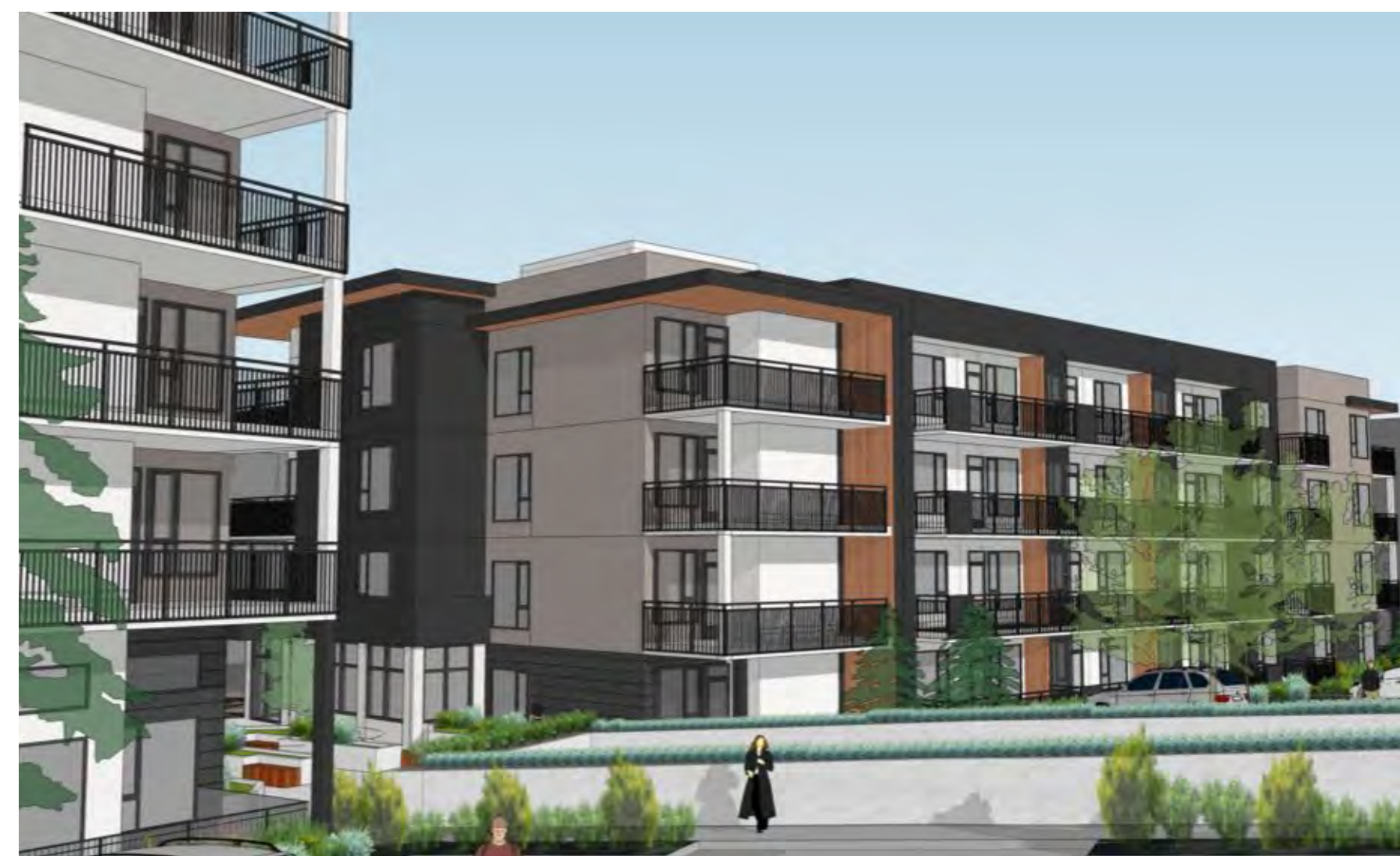
View From Parking