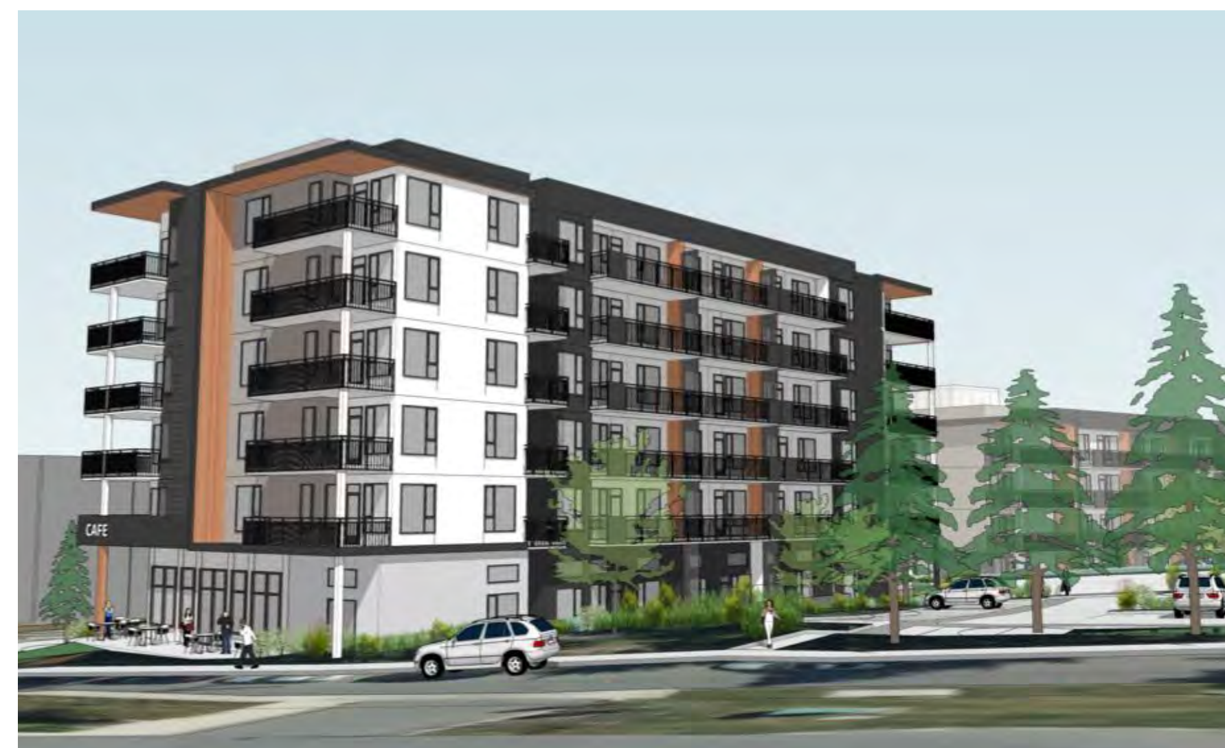
View From West Street Looking Toward Linley Valley Drive