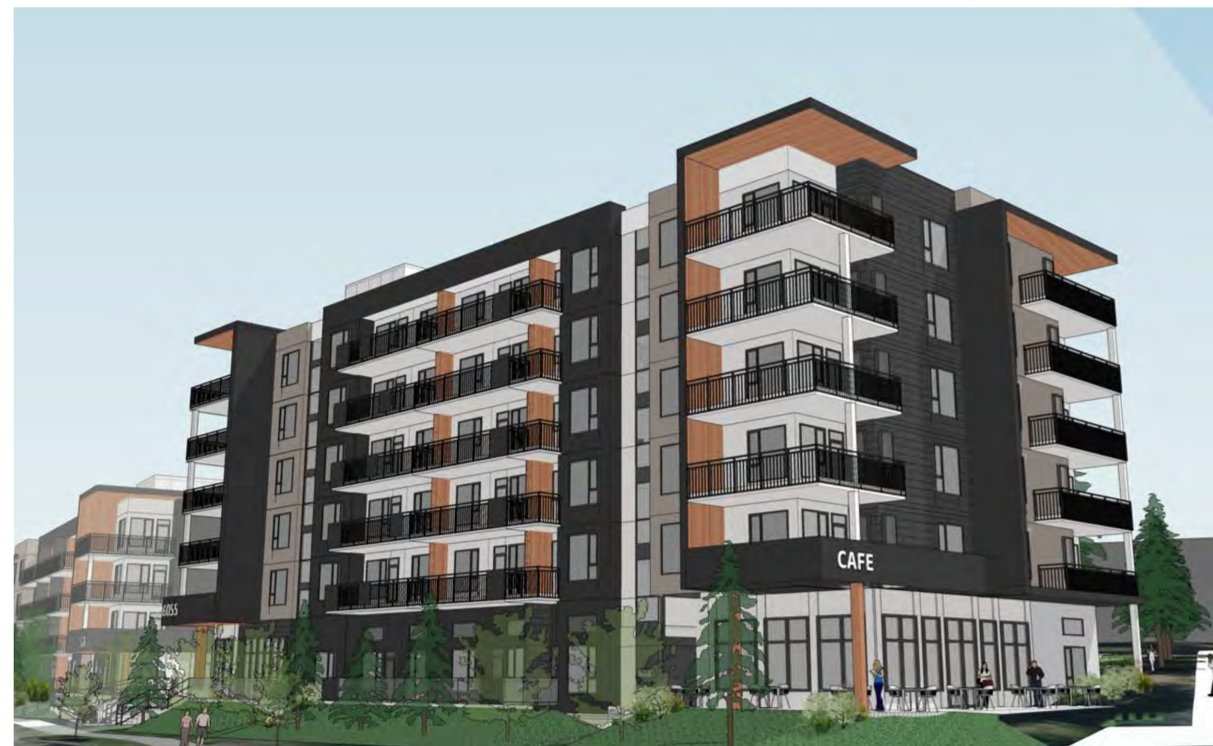
View From Linley Valley Drive