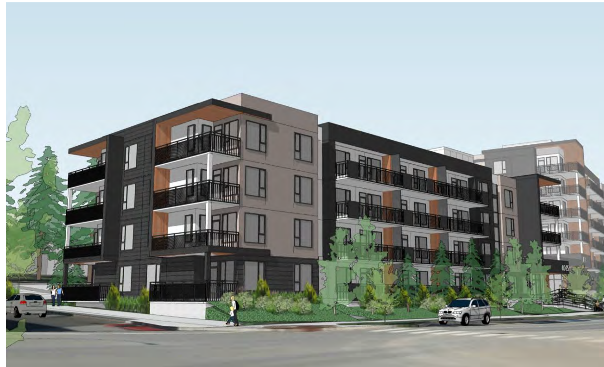
View From Linley Valley Drive