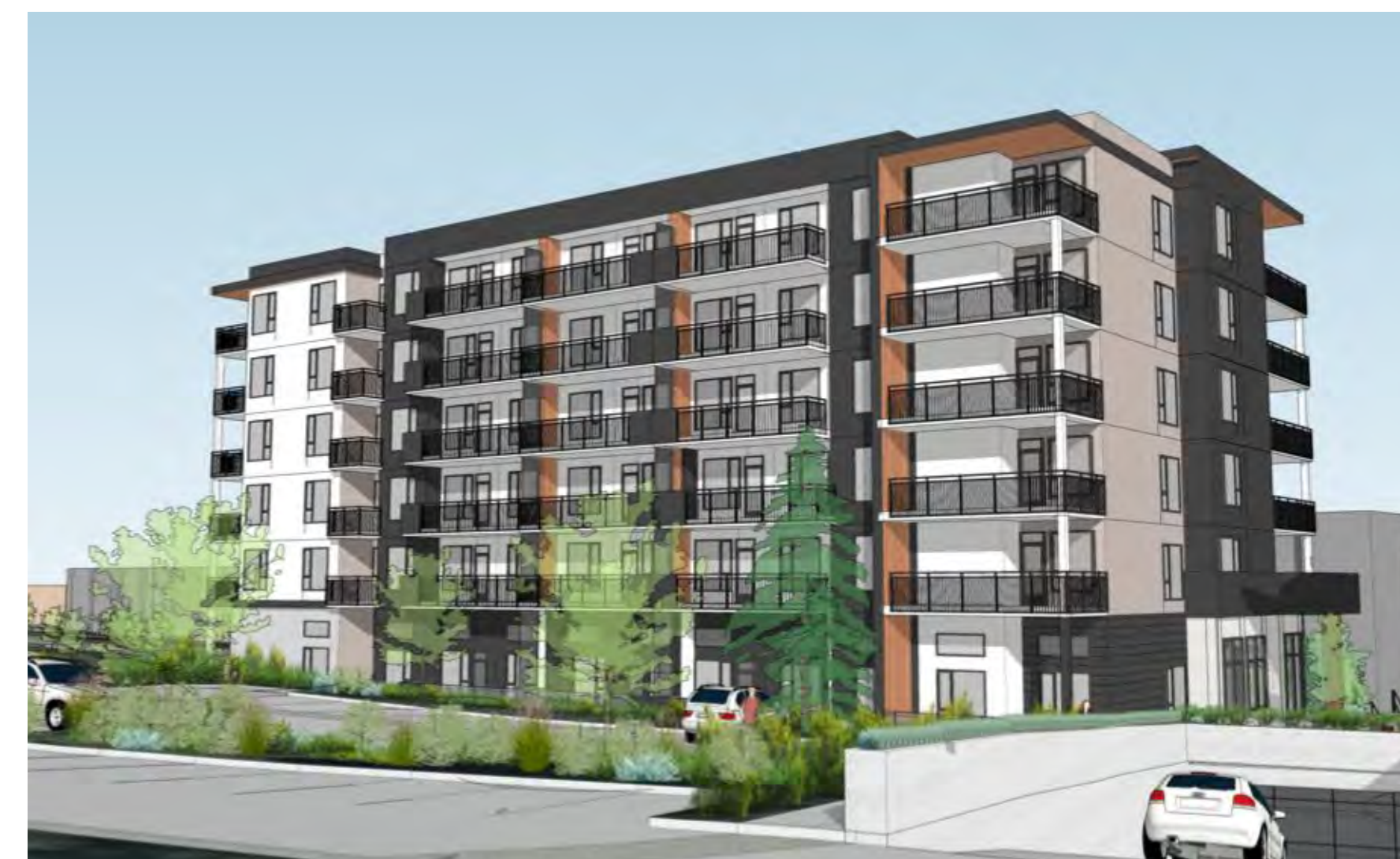
View From Parking

RECEIVED DP1373 2025-JAN-14 Current Planning