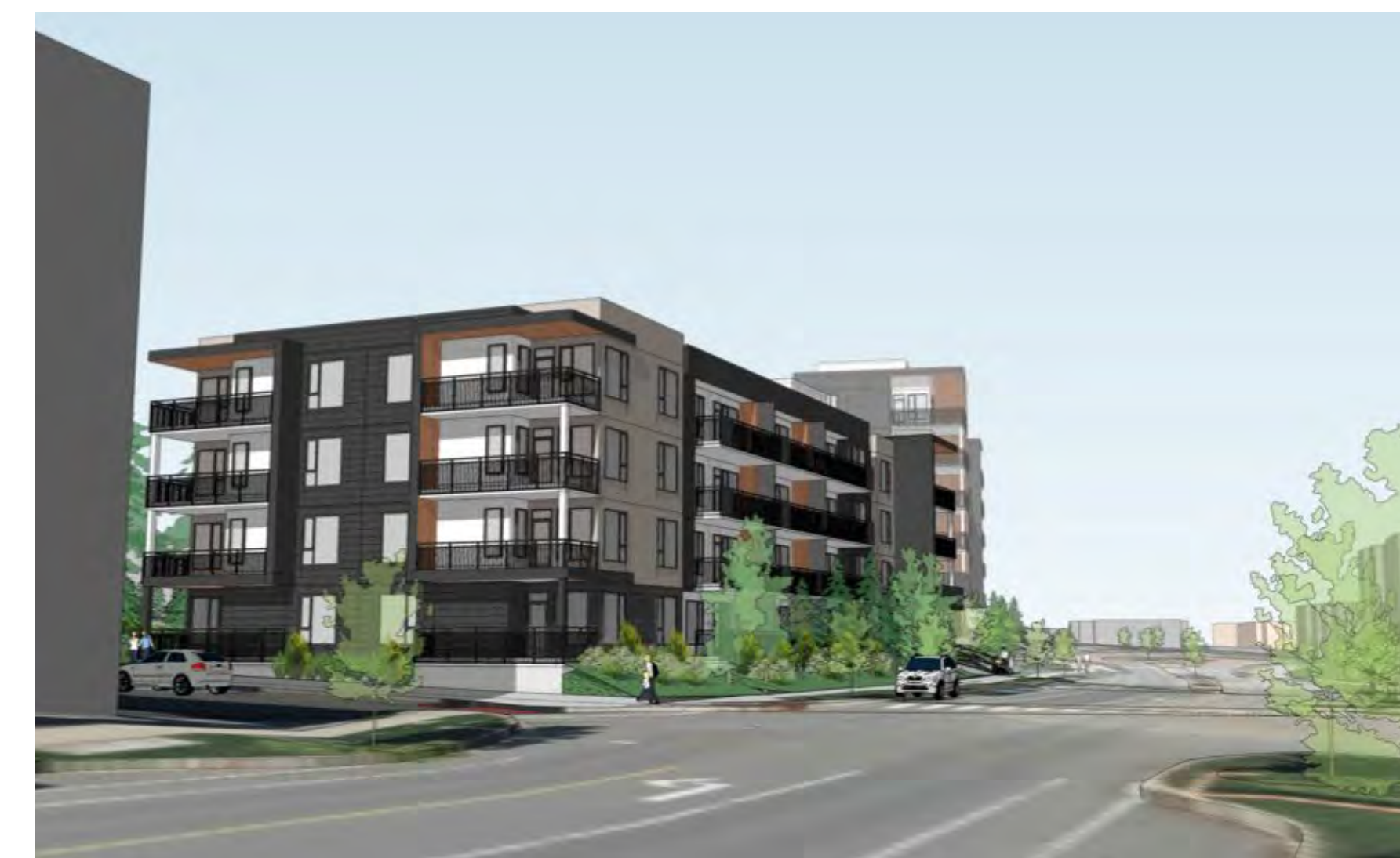
View From Linley Valley Drive to Turner Road