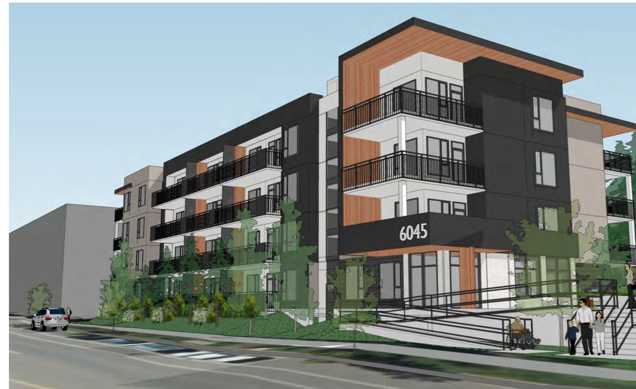
View Of Plaza And Entry From Linley Valley Drive